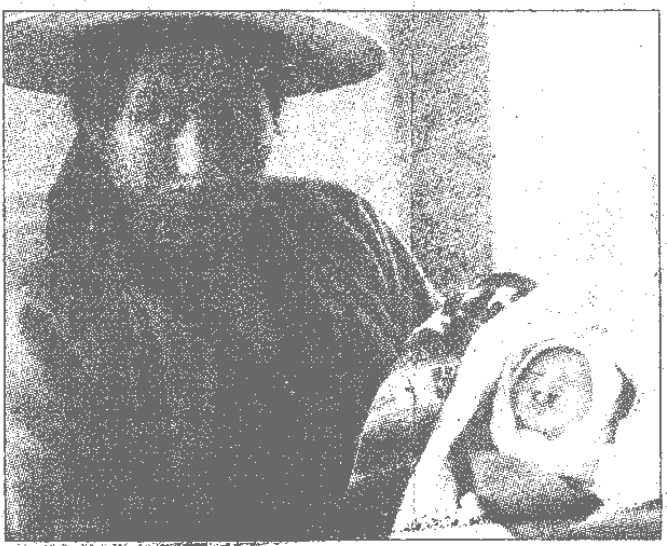
This woman's three-day-old infant was dying because it's double-cleft lip and palate interfered with her ability to eat. The Operation Smile in Bolivia team provided a feeding tube and put the child on next year's patient list.

OUR WEIGHBOR AT FO BOXHOLDER MONTCHANIN DE 19710